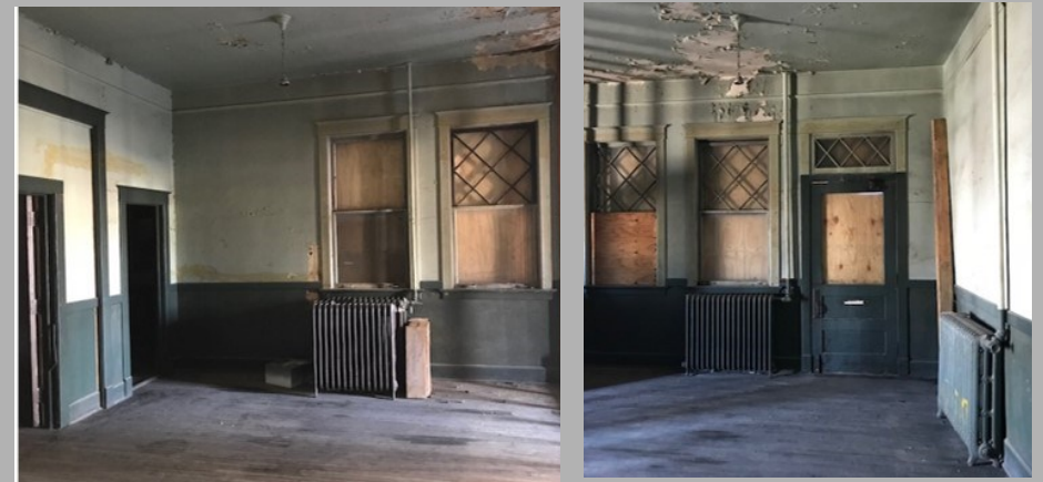
CURRENT INTERIOR VIEWS